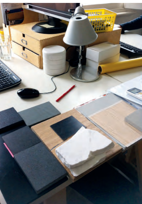
This Page Clockwise from top left: My inspiration board with samples and materials. A snapshot of my desk and my workspace; Eclipse table, designed for NEST at designEX. It was a collaboration between Shareen Joel Design and Share Design; A sketch from when I worked at Ford Motor Company in Detroit. That was a concept car for the Detroit Motor Show; Sketches and samples on my desk; A stack of design and architecture books; Flowers on my desk; Samples in the studio Next page My favourite design objects. Fronzoni '64 Chair by Capellini. Tab Table Lamp designed by Barber Osgerby for Flos.